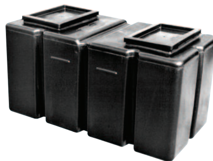
Polytank Rectangular Tank