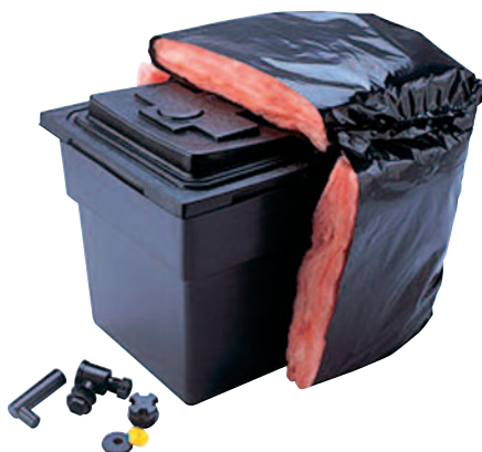
Ferham Rectangular Tank & Byelaw 30 Kit